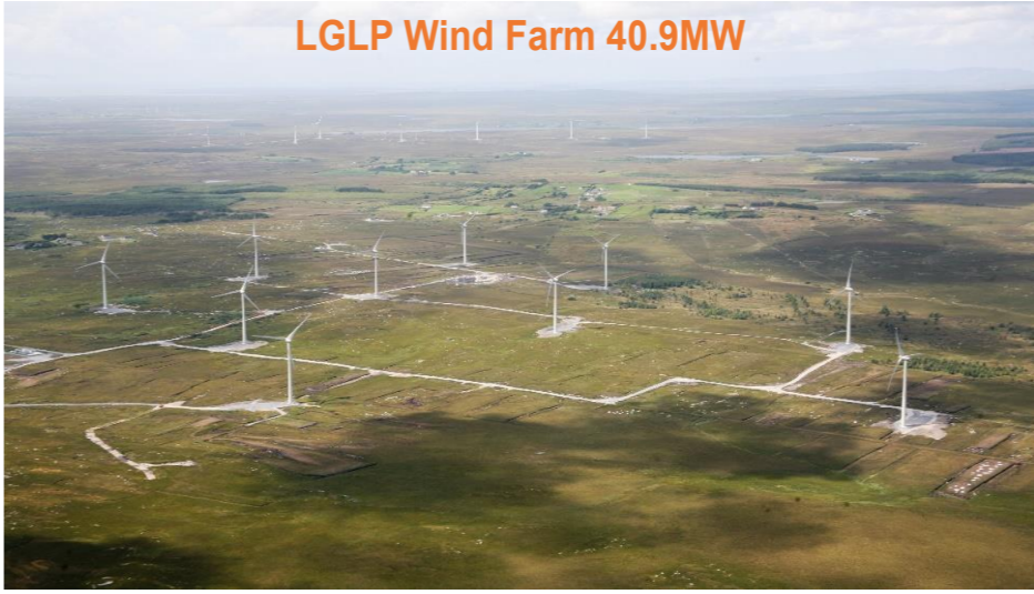
LGLP Wind Farm 40.9MW

Ireland imported 67% of its energy requirement in 2018, one of the highest ratios in Europe. The more of its own energy Ireland can produce, the less vulnerable it would be to foreign policy and conflict interrupting gas, oil, and electricity supply lines. There is an opportunity to continue developing a strong indigenous wind industry, that will take advantage of Ireland's excellent wind resource, reducing our import dependency.