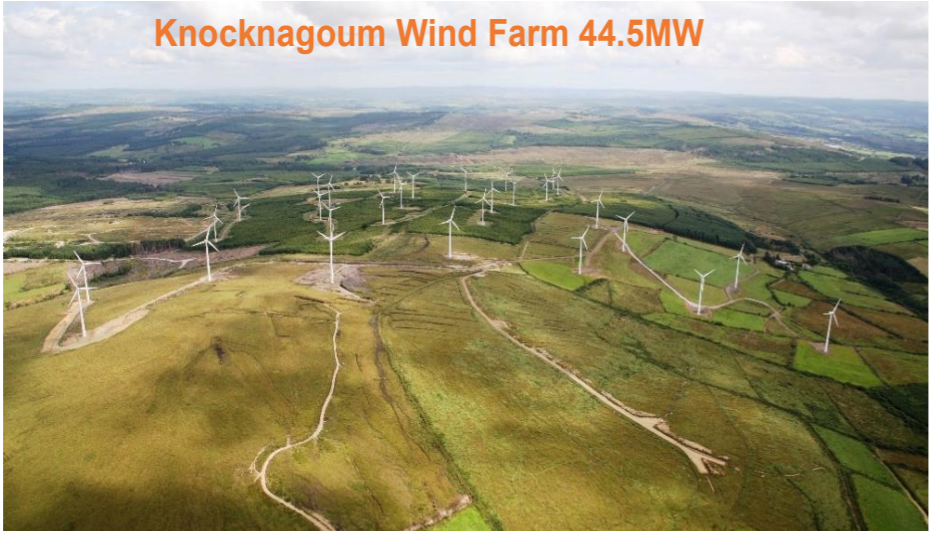
Knocknagoum Wind Farm 44.5MW